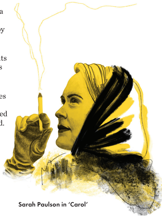
Sarah Paulson in ‘Carol’